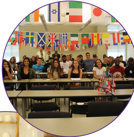
International students learn more about LSUA.