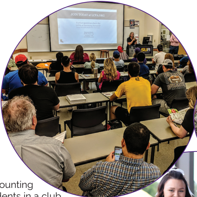
Accounting students in a club meeting.