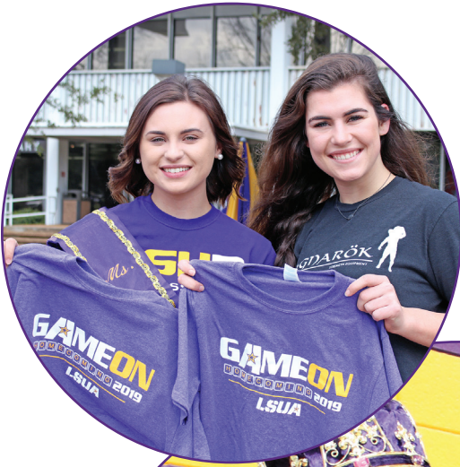
Free Homecoming shirts.