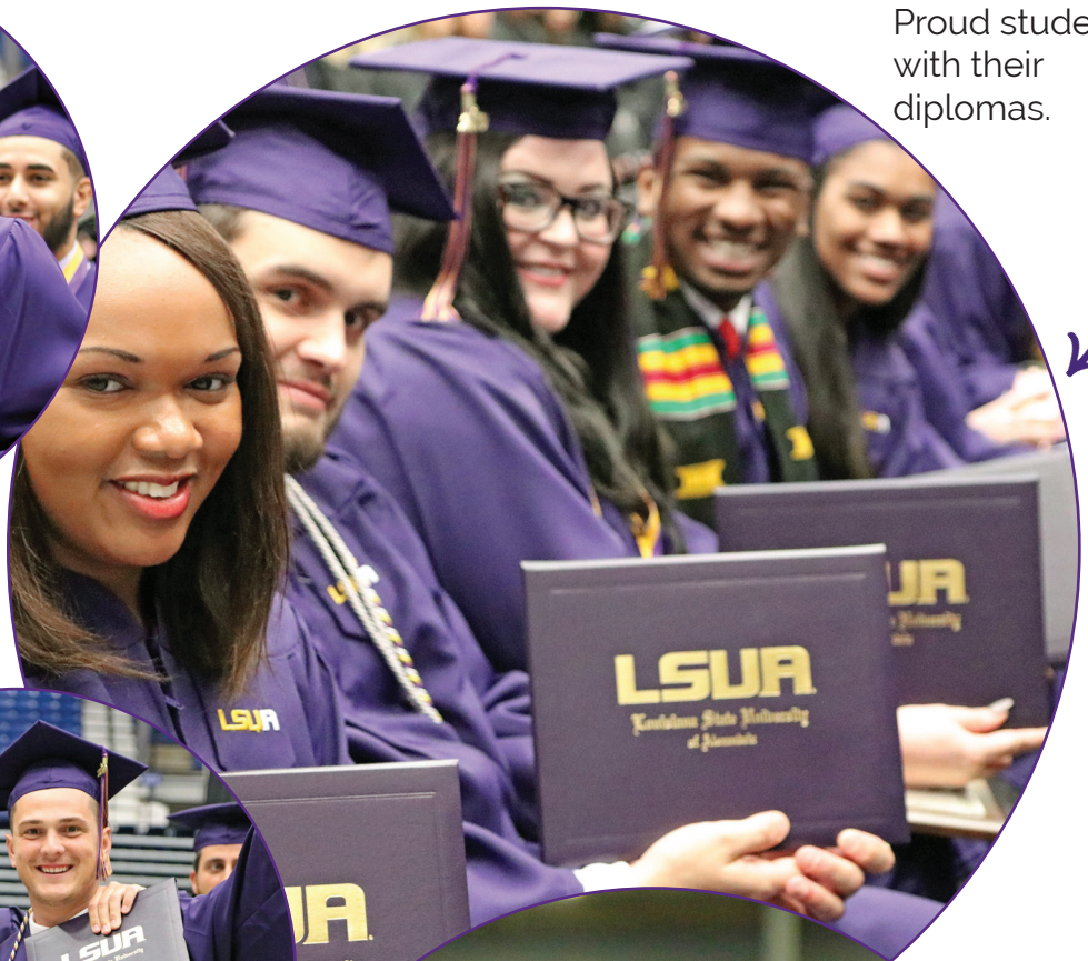
Proud students with their diplomas.