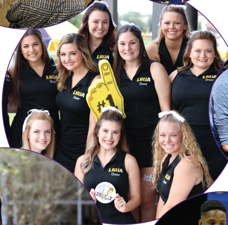
LSUA Cheer Team at the Block Party.