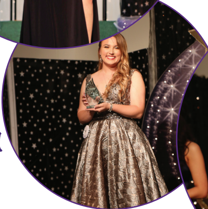
Everyone looking their very best!