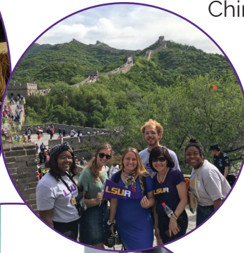
Students visit the Great Wall of China.