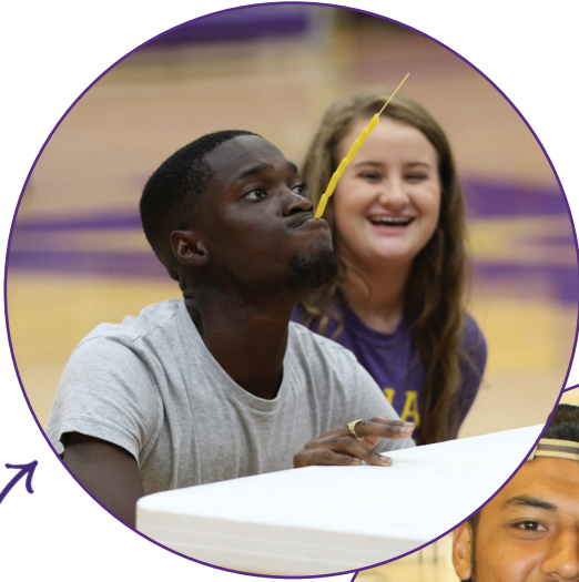
These games are hard work.

Overall, the events were a large success and the University looks forward to expanding on this new tradition before the start of every fall semester.