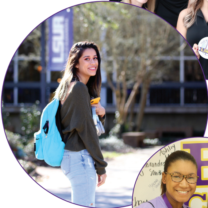
Student headed to class.