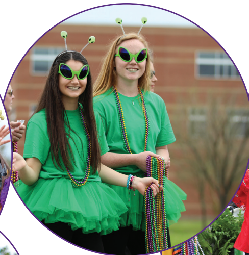
Everyone loves a parade!