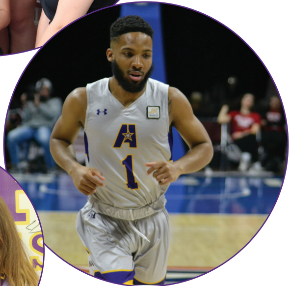
LSUA again represented in the NAIA National Basketball Tourney.