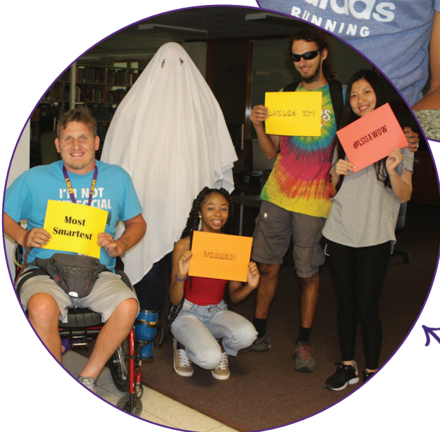
They made it out of the library despite the ghost.