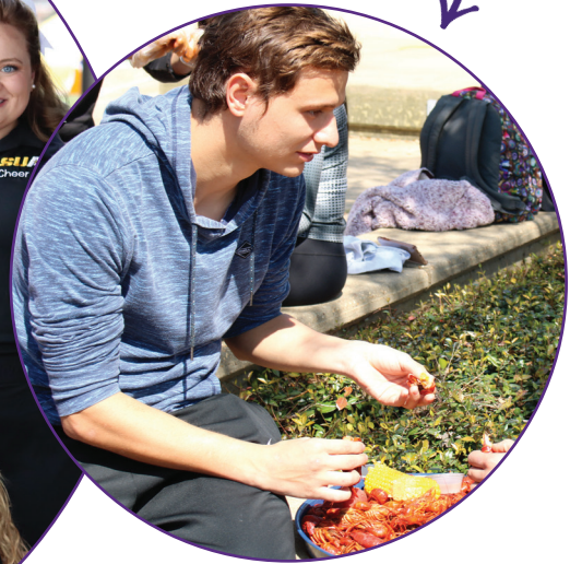
Student Government Crawfish Boil.