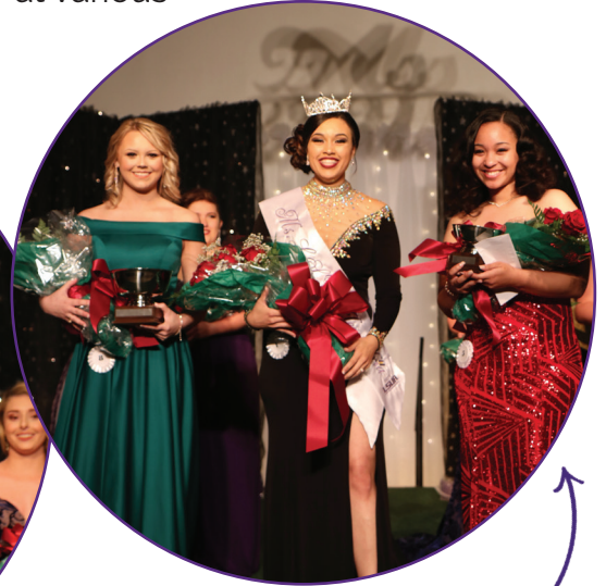
The top-3 finalists!