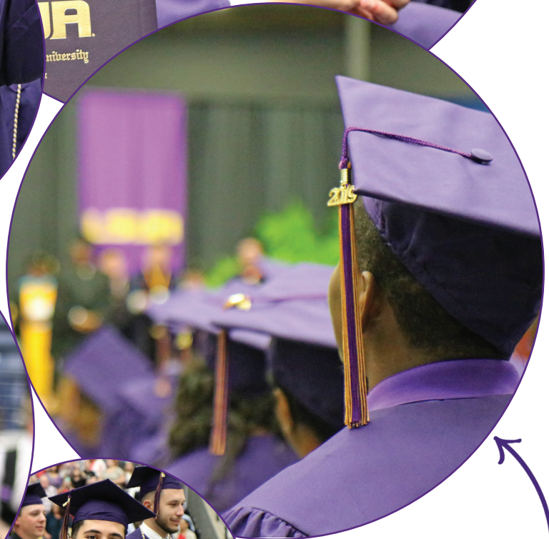
Students watch the ceremony.