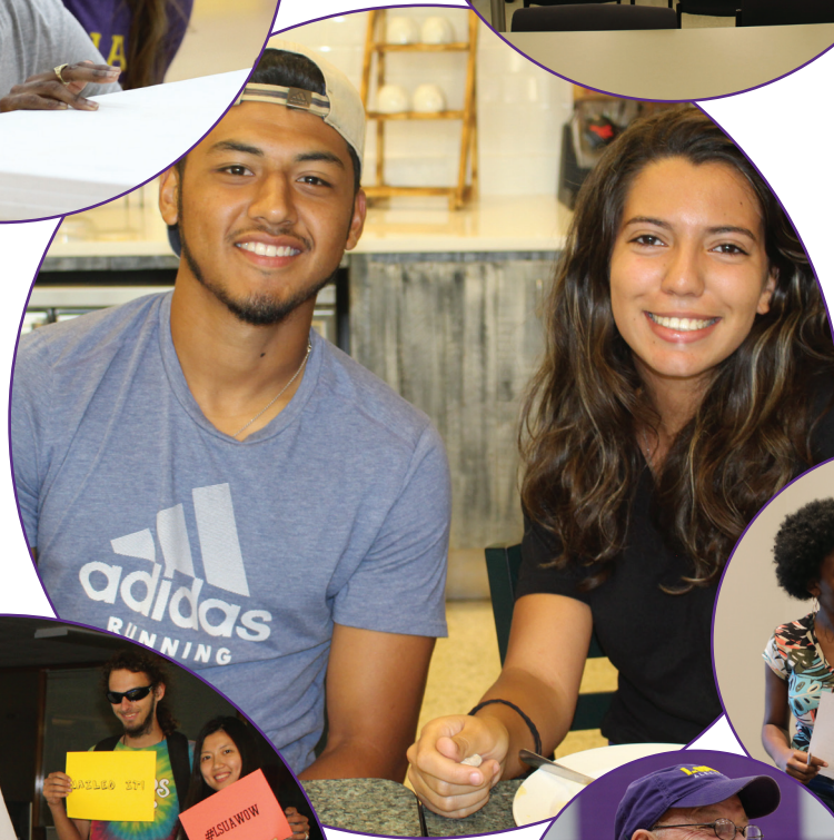
All smiles during lunch.