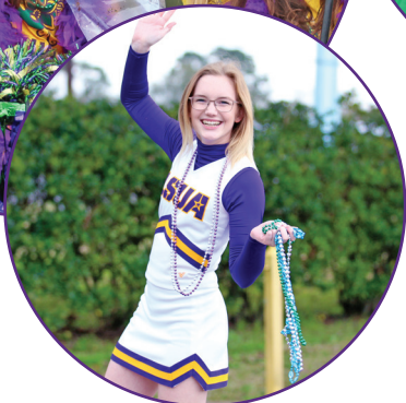
Throw me something!