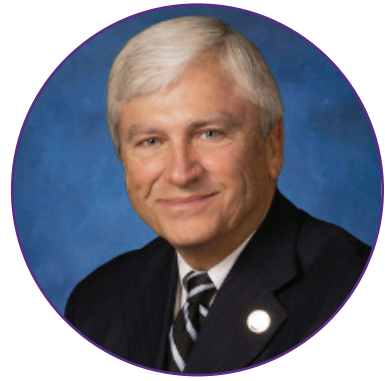
Senator Gerald Long