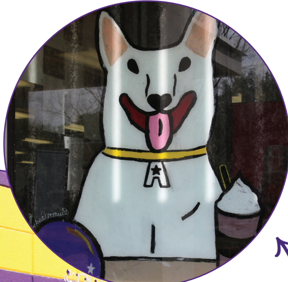
Drawing of Tank in the Starbucks window.