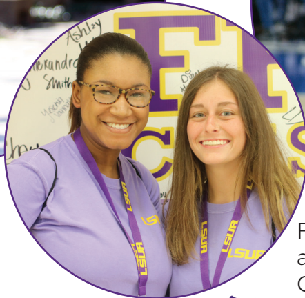
Freshmen learning about LSUA at Orientation.