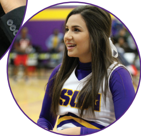
Cheerleaders get in on the action.