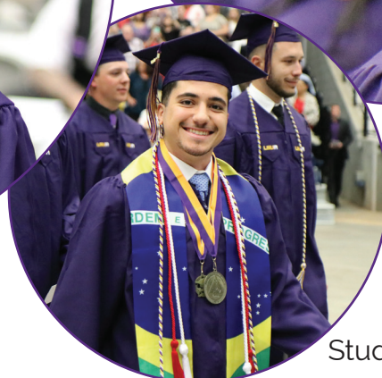
Students walk into the ceremony.