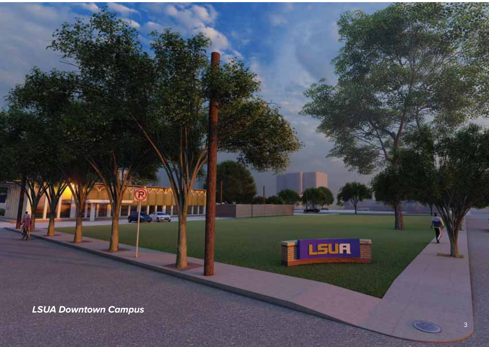
LSUA Downtown Campus

LSUA Student Success Center - In the spirit of updating and modernizing LSUA's campus to meet growing enrollment and the challenges associated with serving the needs of a growing student body, we MUST begin planning for